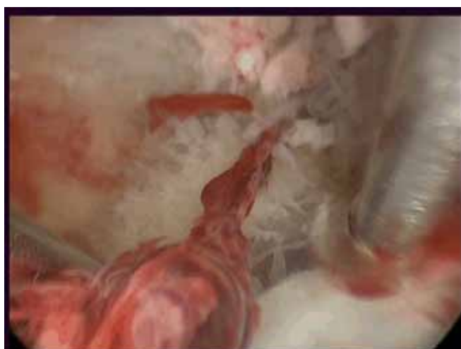
Figure 6: Resectoscopic CSP removal. Using the 4 mm bipolar loop, a cold separation of villous trophoblast from the cervico-isthmic placental bed is in progress.