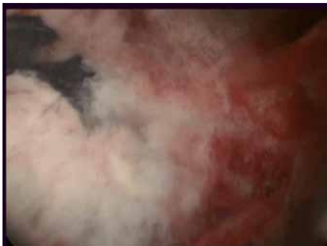
Figure 5: Resectoscopic CSP removal. The caudal extension of gestational sac demonstrating the break of the capsular decidua resulting from the previous office intervention.